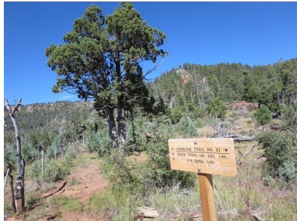
SIGNS THAT SAY "HIGHLINE TRAIL" OR "#31"