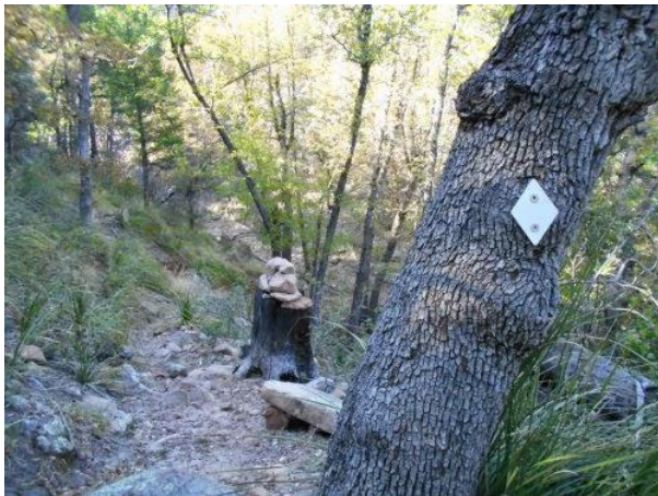
REFLECTIVE DIAMONDS NAILED TO TREES