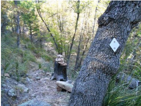
REFLECTIVE DIAMONDS NAILED TO TREES