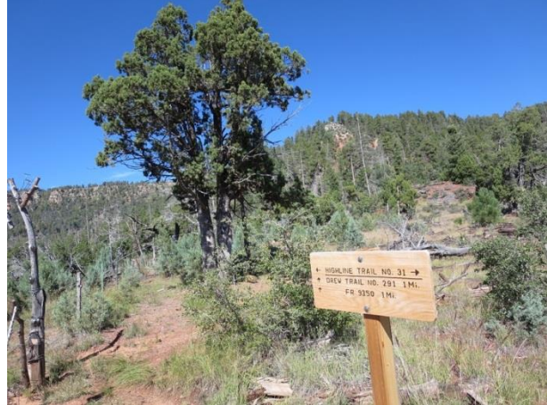
SIGNS THAT SAY "HIGHLINE TRAIL" OR "#31"